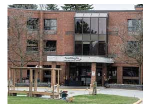
Forest Heights LTC home under Mandatory Management Order after the for-profit facility failed to control a COVID-19 outbreak that resulted in the deaths of 51 residents.