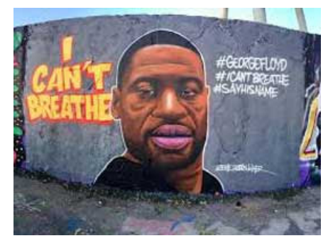
Unifor condemns killing of George Floyd by Minneapolis police, as his death prompts demands to end anti-black racism in the U.S. and around the world.