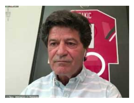
COVID-19 restrictions have not stopped Unifor from advocating to improve federal pandemic aid, with Jerry Dias providing virtual testimony to House and Senate Committees.