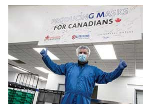
Members at General Motors Oshawa are back on the job to make 10 million surgical-grade masks for frontline health care workers.