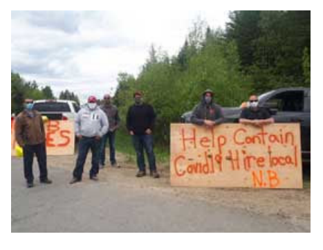
Nackawic pulp mill members are standing up to the New Brunswick government's double standard in allowing out-of-province workers on site without a 14-day quarantine.